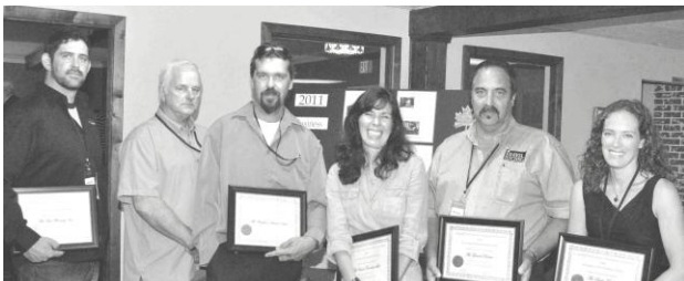
Left to Right: Tile Tech Flooring Inc., All Weathers Service Depot, McNamee Concrete Inc., The Gravel Doctor and the Light Touch.